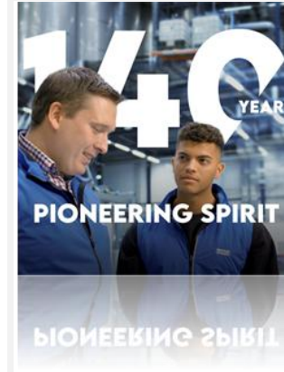
140 years OTTO

Additional production premises in Kaltenbrunn