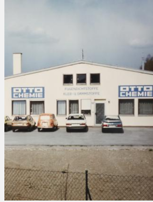
The start in Fridolfing

Entwicklung High-quality silicone sealants were developed in Munich