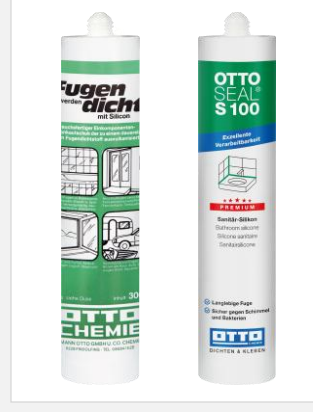
50 years OTTOSEAL® S 100

Anniversary 140 years OTTO company anniversary