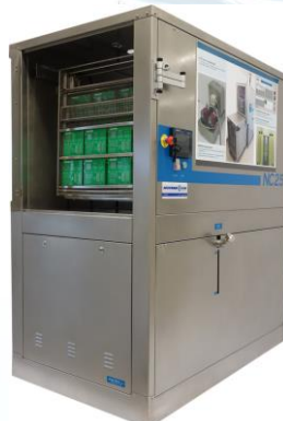
N29HV & NC25