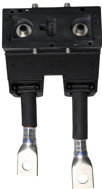
ITA Mating face