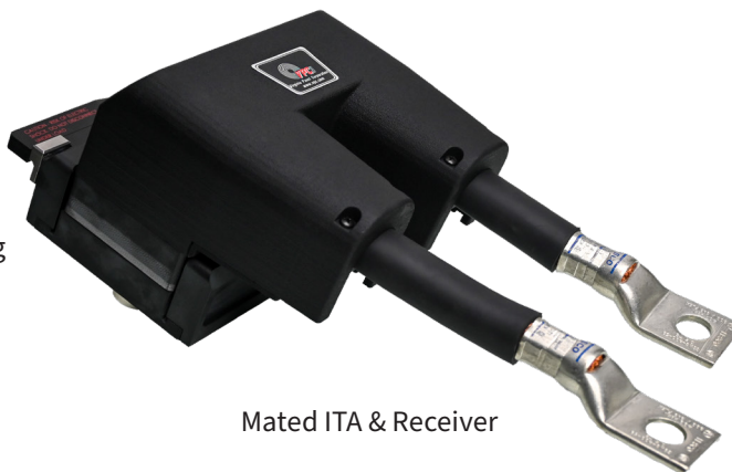
Mated ITA & Receiver

HANDLE ACTUATION FOR HARNESS TO RACK CONNECTION Prevents rack-to-connector wear- ITA makes UUT connection and endures test cycling versus the connector